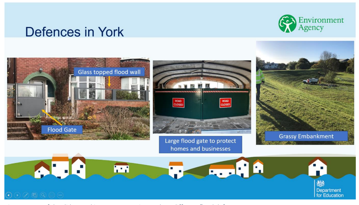
Figure 1: one of the slides used in our presentation to show different flood defences.

We are also shortly running a similar session with Year 5s at St Peters School, and also have plans to visit Scarcroft Primary school in the Summer term. Our engagement team is working on plans to build our education outreach further across the city to continue promoting the work we are doing to better protect properties against flooding.